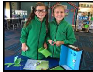
Te Ara Tupu, water experiments and dioramas, such fun!!!!